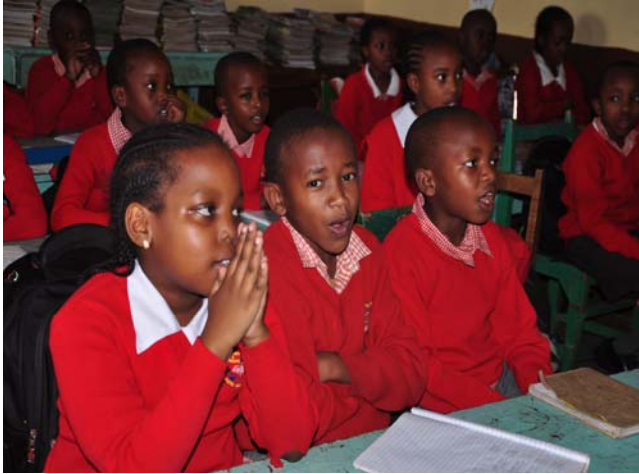
Class 3 pupils are busy undergoing a NASMLA exercise