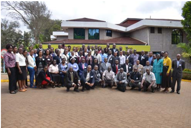
Participant in an on-going three-day workshop of contracted Firms Key Representatives Trainers of Trainers (ToTs) on School Improvement Planning at the Kenya School of Government